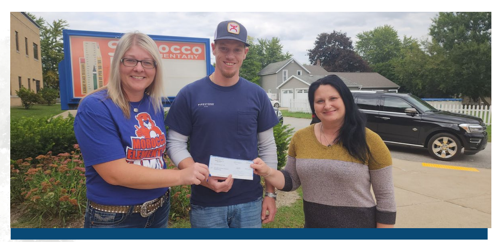
NORTH NEWTON SCHOOL CORORATION Sponsored on behalf of Northwind NWP Sows

Fuel4Kids is a program sponsored by PIPESTONE to assist children at schools near our offices and managed sow farms. The initiative focuses on addressing food insecurity and supplying essential items to children in need within their communities.