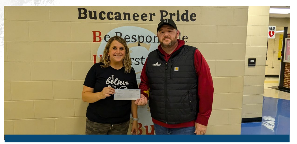
EAST BUCHANAN SCHOOLS