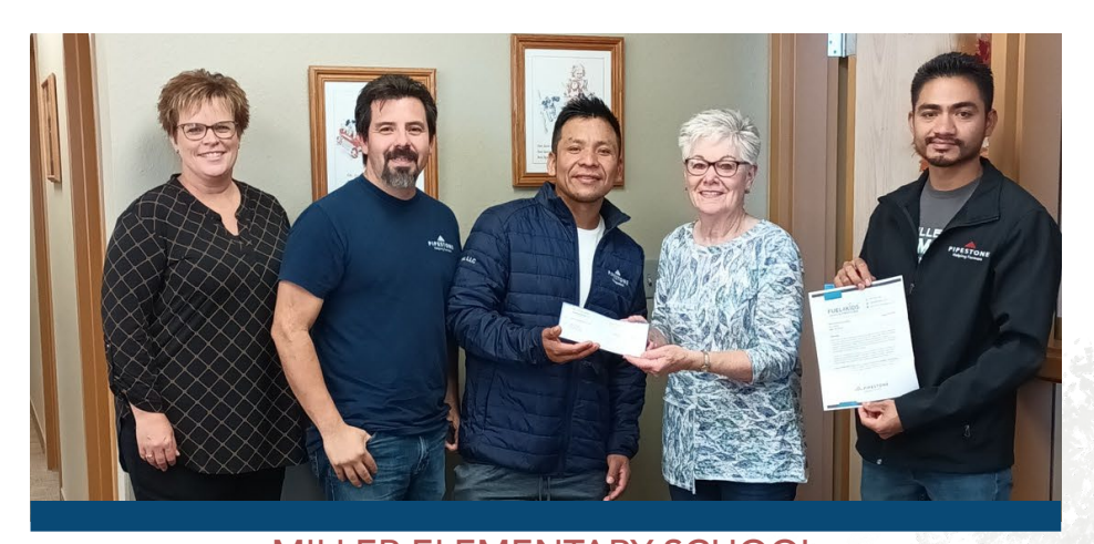
MILLER ELEMENTARY SCHOOL Sponsored on behalf of Nordic