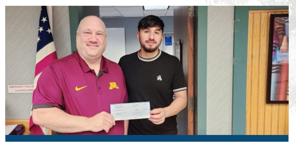
PARK ELEMENTARY Sponsored on behalf of Pheasant