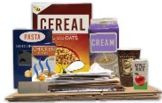
PAPER, CARDBOARD & CARTONS