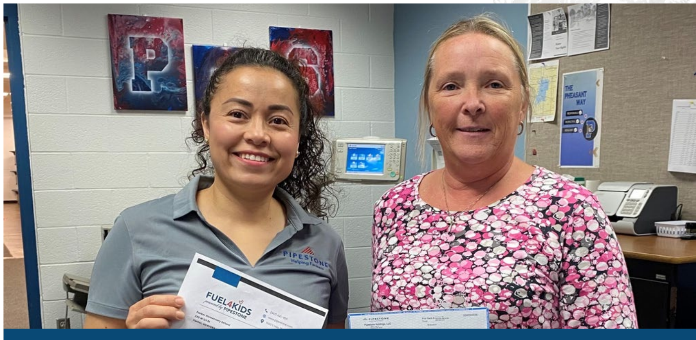
PARKER ELEMENTARY SCHOOL Sponsored on behalf of Fox Run