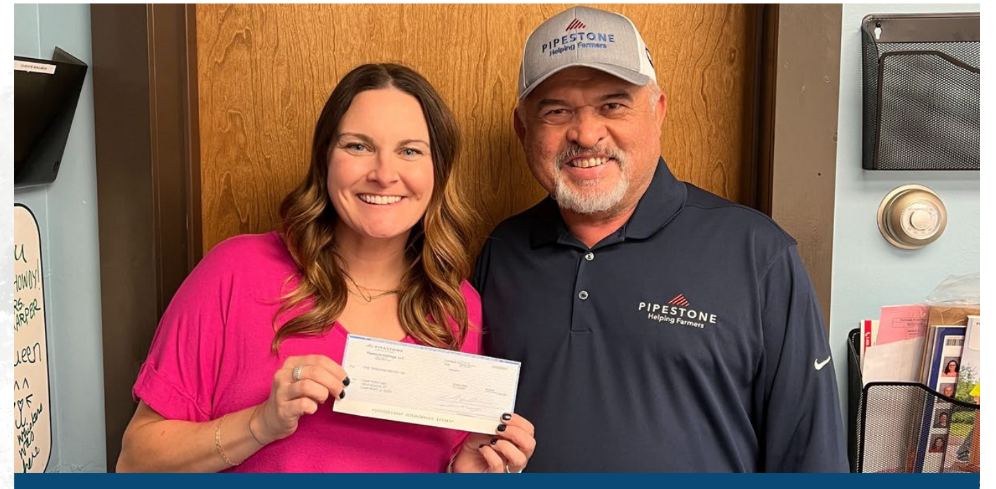
CENTRAL ELEMENTARY SCHOOL Sponsored on behalf of New Era

The initiative focuses on addressing food insecurity and supplying essential items to children in need within their communities.