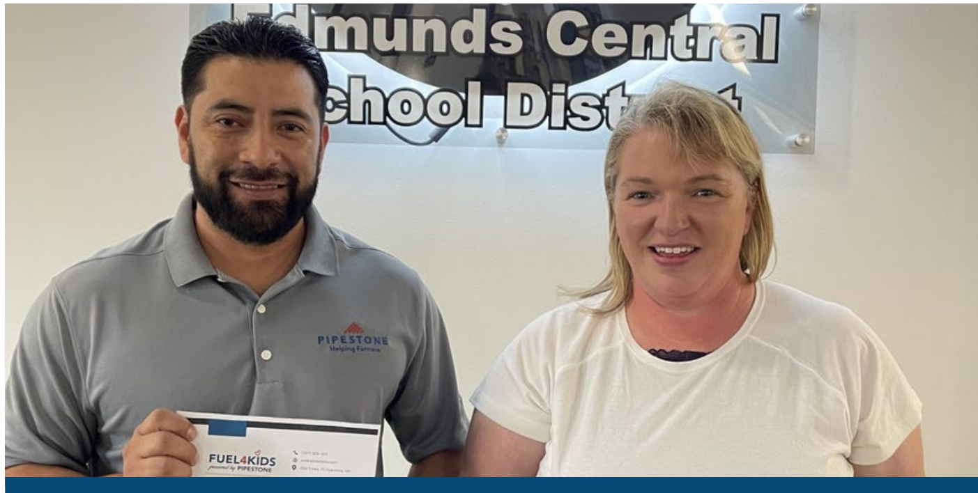
EDMUNDS CENTRAL SCHOOL DISTRICT Sponsored on behalf of Mallard Bay