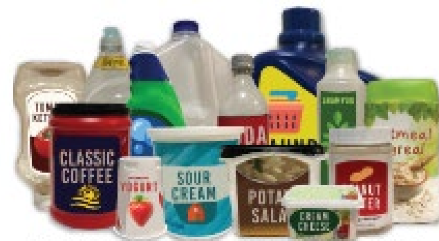
PLASTIC BOTTLES, TUBS & JUGS