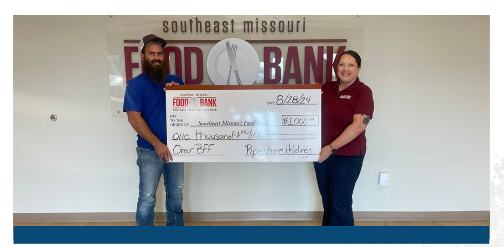
ORAN ELEMENTARY SCHOOL Sponsored on behalf of Delta Gilts