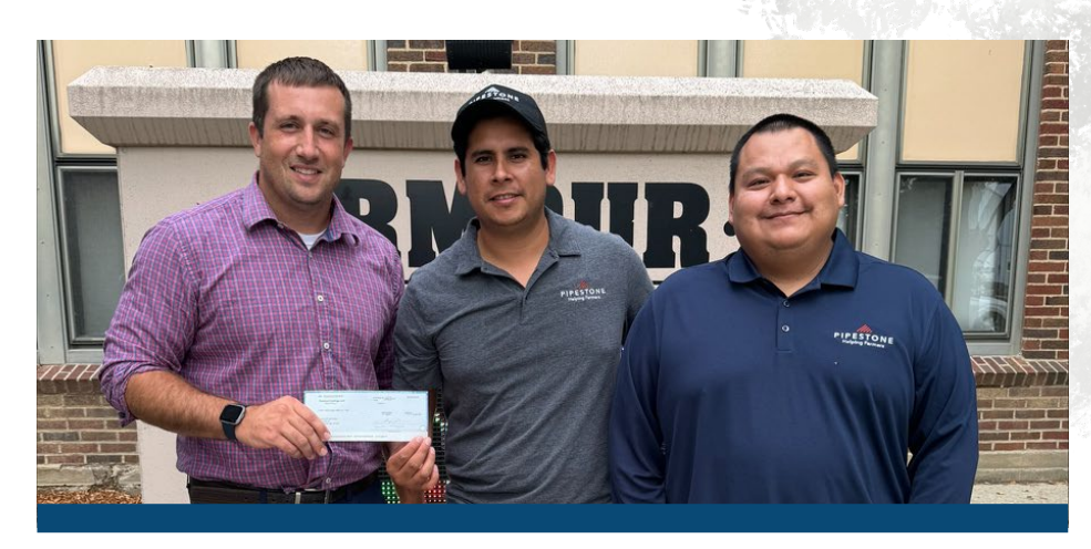
ARMOUR SCHOOL DISTRICT

Sponsored on behalf of Goose Lake 2, Longview