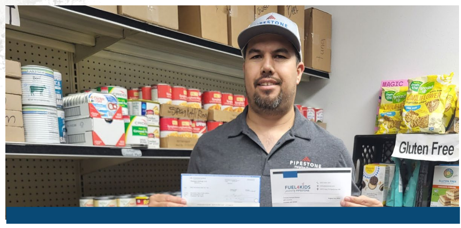
TRUMAN SCHOOL DISTRICT