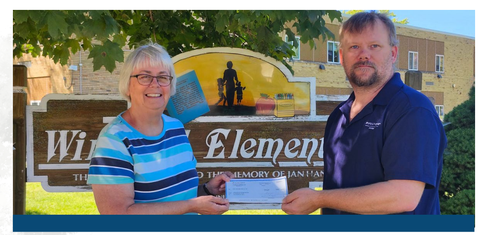
Sponsored on behalf of Blakes Point

Fuel4Kids is a program sponsored by PIPESTONE to assist children at schools near our offices and managed sow farms. The initiative focuses on addressing food insecurity and supplying essential items to children in need within their communities.